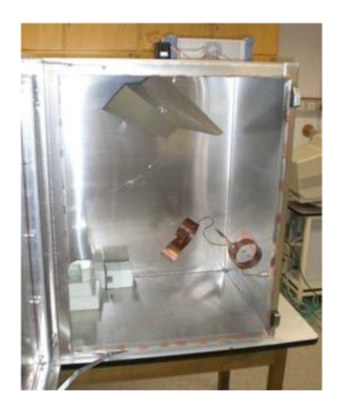
Fig.1: Small size ERC used for testing.

The relevant international standard IEC 61000-4-21 [IEC11] unfortunately recommends a minimum volume of 70 m<sup>3</sup> for an ERC, which exceeds the space available in most EMC laboratories and consequently restricts their applicability (see Fig. 1 for a typical example of a "small" ERC). Additional research on small scale ERCs will therefore provide smaller companies with an affordable test method. Numerical simulations of the electric fields in a small ERC are presented in [10].